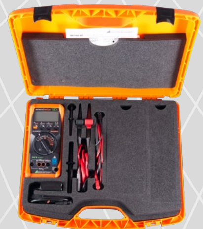
METRAHIT | H+E CAR-Set