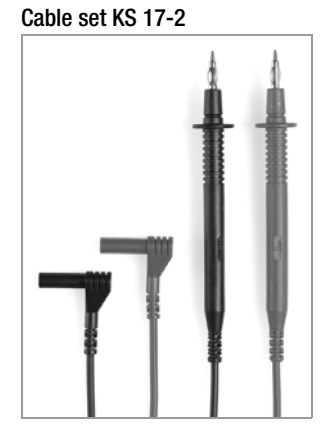
Carrying pouch F841