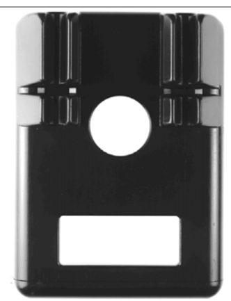
Protective rubber cover as viewed from the bottom with guide rails for fastening the test probes