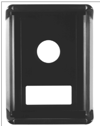
Protective rubber cover as viewed from the top Opening at the bottom for mechanical zero point setting